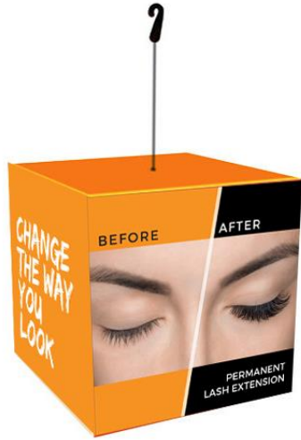
ONLY In store Branding Elements with regular social media postings and event collaterals