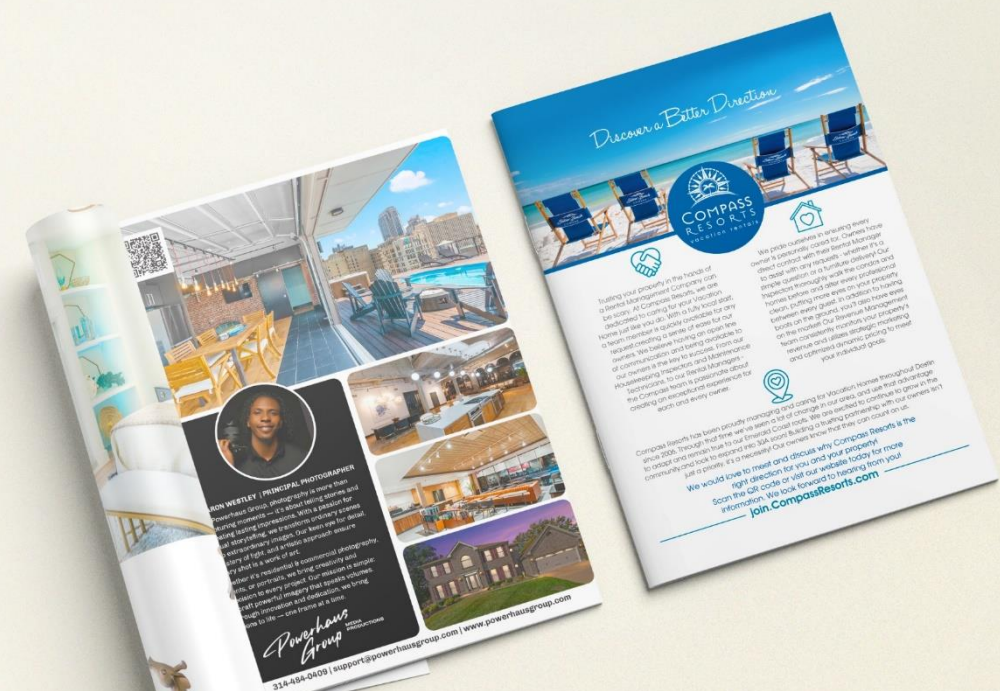
PRINT ADVERTISEMENTS FOR US CLIENTS – FOR REMAX MAGAZINES