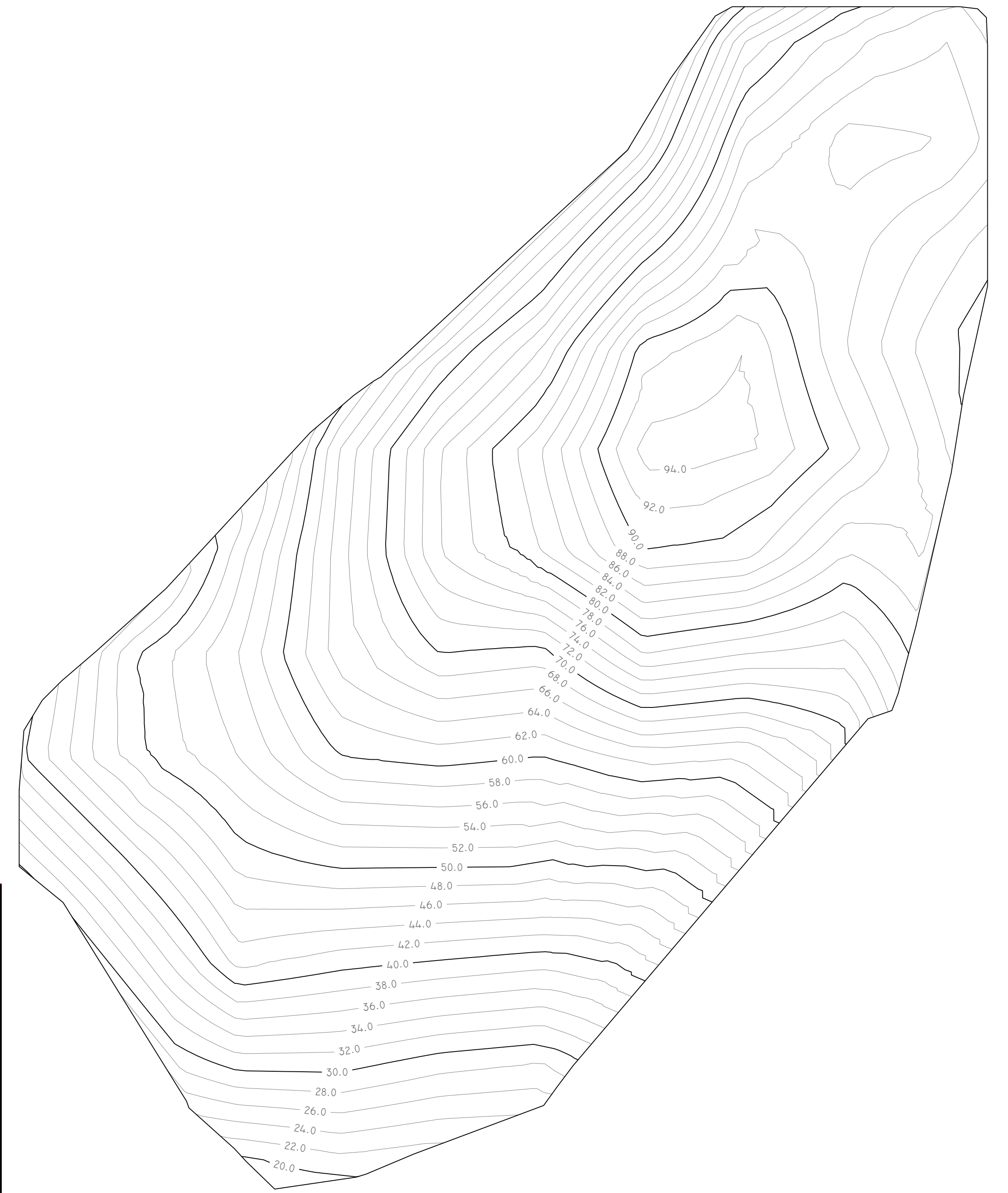
① 2D ELEVATION BANDING SCALE 1:1000