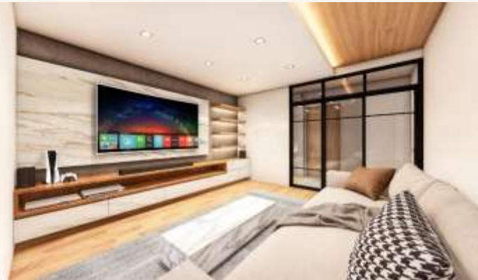
SANTOS RESIDENCE San Jose, Navotas City