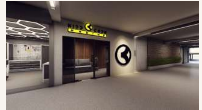
KIDCODE RACING Navotas City

The Kidcode Racing facility, dedicated to the distribution of small CC racing motorcycles, is designed as a high-performance workspace that reflects the brand's passion for speed, precision, and innovation. The design seamlessly integrates functionality with an industrial-modern aesthetic, creating an efficient, stylish, and dynamic environment