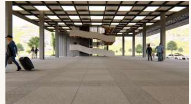
MULTI-MEDIA CENTER Los Baños, Laguna

The building's contemporary and industrial aesthetic is achieved through the use of exposed concrete, glass, and steel, emphasizing durability and a minimalist modern look. The large cantilevered roof and open facade create an inviting space while providing ample shade and ventilation.