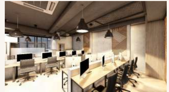
R NUBLA SECURITY INC. Binondo, Manila

The R NUBA Office in Binondo presents a modern, minimalist, and professional workspace that emphasizes warmth, functionality, and contemporary aesthetics. The design seamlessly blends natural textures, open spaces, and sophisticated lighting, creating an environment that fosters productivity, collaboration, and comfort.