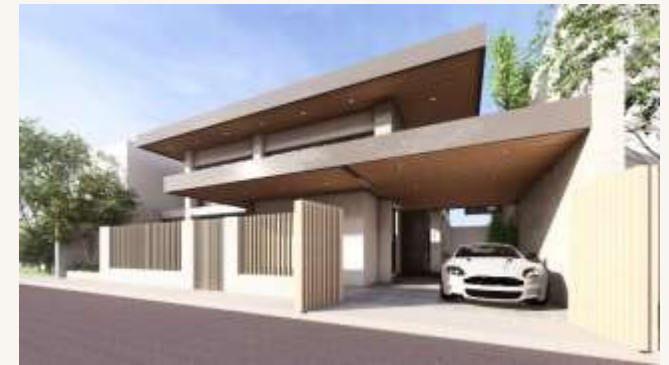
NUQUE RESIDENCE BF Homes, Las Piñas

This design transforms an old single-story house into a modern two-story home, blending contemporary architecture with warm, natural elements. The renovation prioritizes spaciousness, functionality, and indoor-outdoor living, making it ideal for a modern lifestyle..