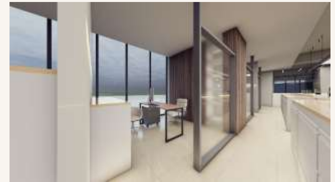
CO BAN KIAT HARDWARE INC. Binondo, Manila

The Co Ban Kiat Inc. (CBK) Headquarters in Binondo is a modernized workspace that reflects the company's 100-year legacy in the hardware industry while embracing contemporary design principles. This corporate space embodies efficiency, professionalism, and innovation, aligning with CBK's mission to be a leader in hardware distribution.