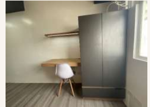
STUDENT PAD Urban Deca Homes, Ortigas

The design maximizes limited floor area by combining multiple functional zones into a single, cohesive layout. A compact bed area, workstation, and mini kitchenette are all neatly integrated, allowing a student to rest, study, and prepare meals without feeling cramped.