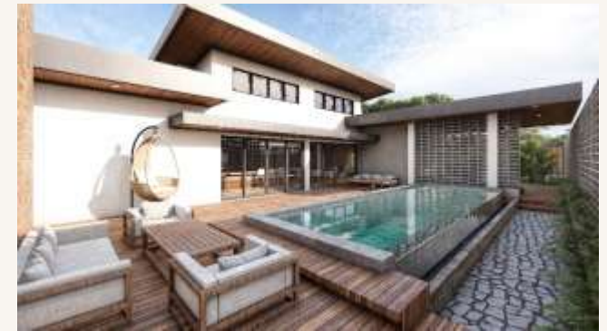
HASSIMAN RESIDENCE Lunzuran, Zamboanga City

The Hassiman Residence is a tropical-modern sanctuary, balancing luxury and functionality while adapting to the local climate of Mindanao. It embodies warmth, openness, and sustainability, making it ideal for contemporary living in the region.