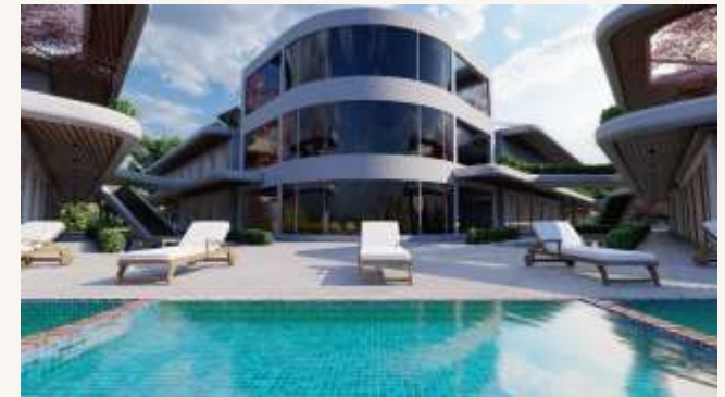
MARO HOTEL AND RESORT Tanay, Rizal

The Maro Hotel and Resort in Tanay, Rizal is a modern luxury destination designed to cater to motorcycle riders and travelers seeking an immersive nature experience. The design integrates contemporary architecture with the natural beauty of Tanay, known for its scenic mountain roads and lush landscapes.