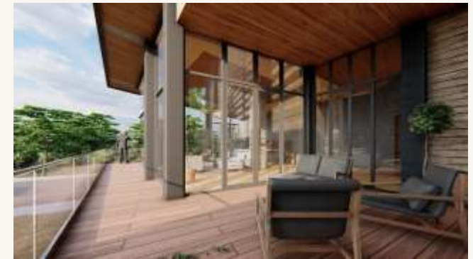
CRUZ RESIDENCE Finback st., Subic

This high-end vacation house seamlessly integrates cutting-edge architectural design with nature, offering an elevated living experience. The design showcases bold geometric structures, expansive glass facades, and luxurious amenities, making it an ideal retreat for relaxation and indulgence