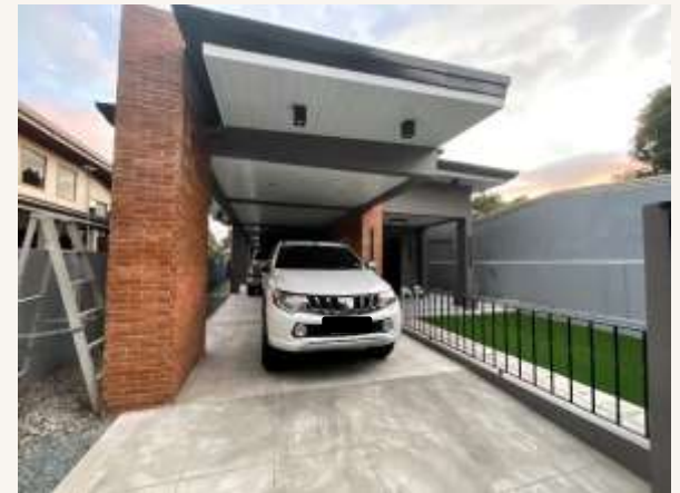
PS RESIDENCE Merville, Parañaaque

This luxurious Mediterranean-style home is designed to blend classic elegance with modern comfort, making full use of the large lot area in Merville Subdivision. Featuring warm earthy tones, spacious layouts, and natural materials, the design creates a timeless and inviting atmosphere.