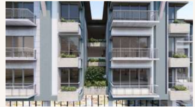
La Villa Condominium Batasan, Quezon City

The 4-storey condominium building in Batasan, Quezon City, is a modern residential development designed to provide a balance of comfort, functionality, and contemporary aesthetics. Featuring a sleek, urban-inspired architectural style, this condominium harmonizes luxurious living with practicality, catering to individuals and families seeking a high-quality lifestyle in a prime location.