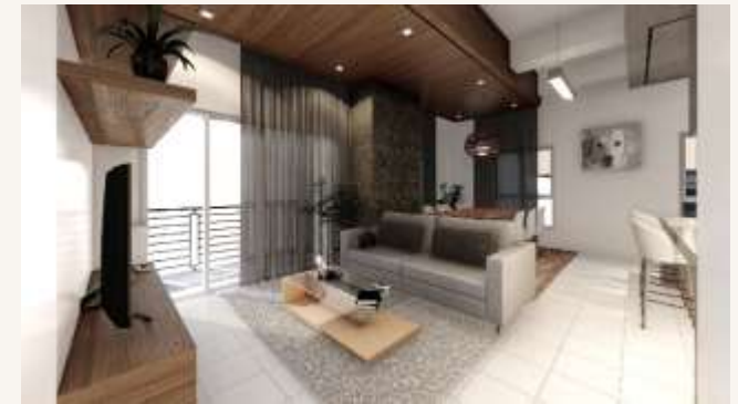
LA SALLE RESIDENCE Sheridan Condominium, Pasig

The La salle Residence is a perfect balance of sophistication and comfort, offering stunning interiors, functional living spaces, and high-end features—all within the prime location of Pasig City. It's the ideal modern luxury home for city dwellers seeking style, convenience, and warmth.