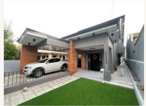
PS RESIDENCE Merville, Parañaaque

This luxurious Mediterranean-style home is designed to blend classic elegance with modern comfort, making full use of the large lot area in Merville Subdivision. Featuring warm earthy tones, spacious layouts, and natural materials, the design creates a timeless and inviting atmosphere.