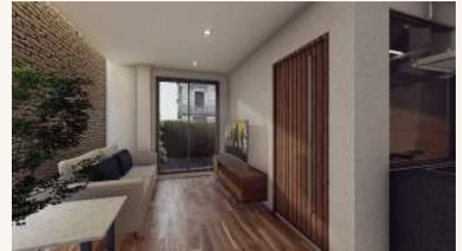
SLAT RESIDENCE Malabon City

The Vergel Residence is a stunning example of contemporary architecture, featuring a cantilevered design that blends modern aesthetics with functionality. This home showcases a sleek, geometric form that maximizes space, enhances natural light, and provides an open, airy atmosphere.