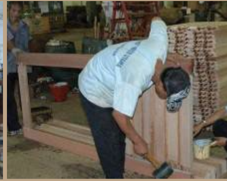
Assembly and hydraulic pressing with pressure indicator.