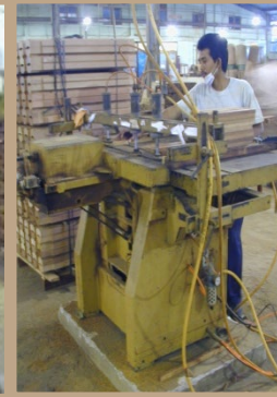
Multi Horizontal Boor.