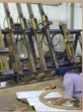
Assembly using hydraulic press, both for chairs & tables..