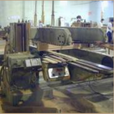
Double cut saw.