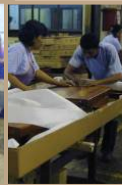
Final QC and packing.