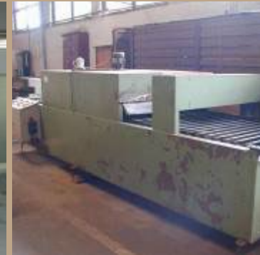
Shrink plastic wrap & good palleting.