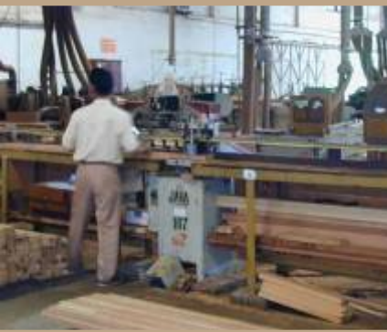
Precise multi booring.