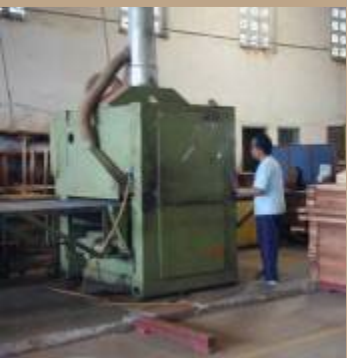
Wide Belt Sander. Double cut saw, door size calibration.