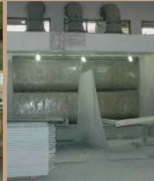
Finishing in a dust free spray booth.