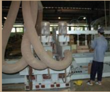
Linear Copy Shaper, to mold any shape in bulk quantity.