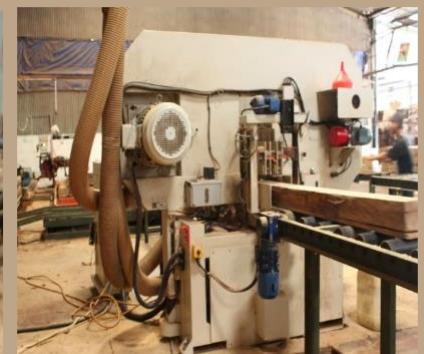
Sawmill : Logs cut into desired sawn timber sizes.