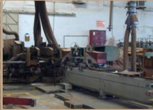
Double end profiling.