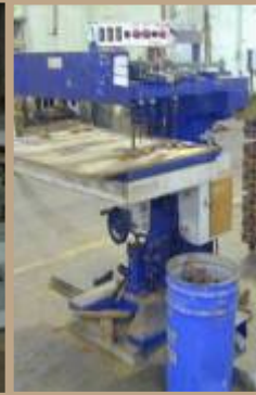
Multi Vertical Boor.