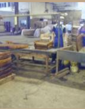
Dipping method finishing.