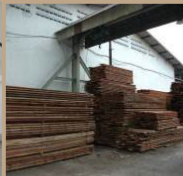
Kiln dry : 7 chambers up to 350m 3 , electronic panel, timber moisture content controlled regularly.