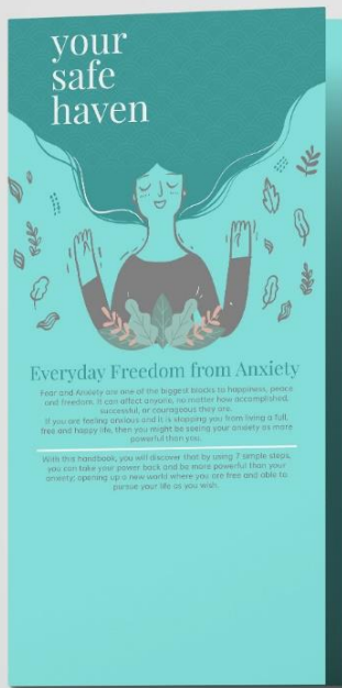
A pragmatic infographic brochure providing an "Everyday Freedom from Anxiety" toolkit. It distills mental health strategies into accessible, actionable steps for both immediate and long-term relief.