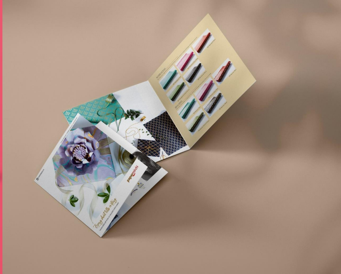
An artisanal product catalog highlighting sustainable, handcrafted gift wrap. The taglines "Every sheet tells a story" and "Batik Collection" beautifully frame their vibrant, eco-conscious aesthetic.