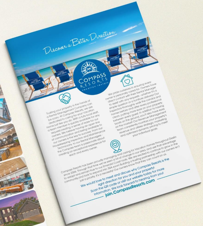
Targeted advertisements for real estate magazines