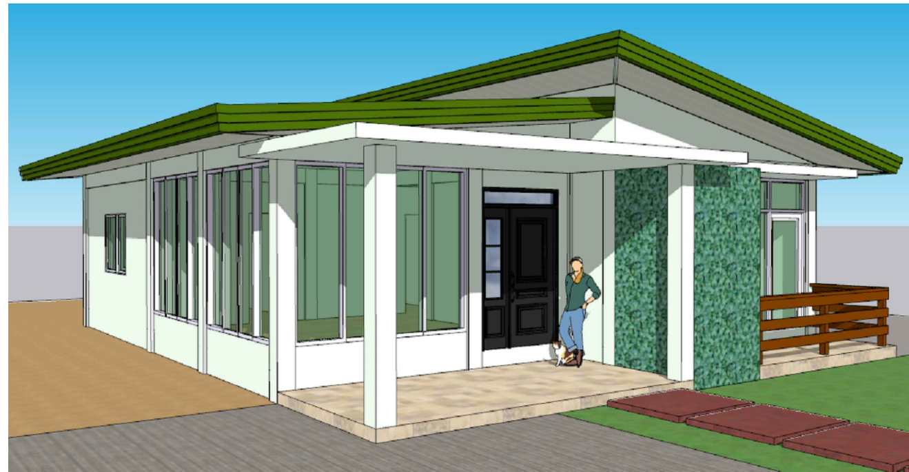
A 13 EXTERIOR PERSPECTIVE DRAW NOT TO SCALE